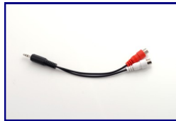
Stereo Phone Jack (1 x 2)