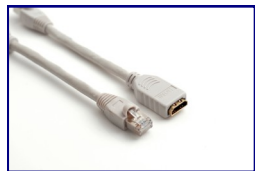
RJ-45 to HDMI Adapter