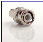
75 Ω Terminator