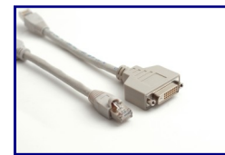
RJ-45 to DVI Adapter