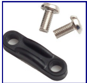
Power Adapter Fastener