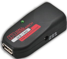
USB 2.0 over UTP Extender with Wall Plate Local Side

USB 2.0 Extender on Single UTP Cable To 165 ft (50 m)