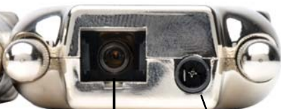
Optical Cable Input