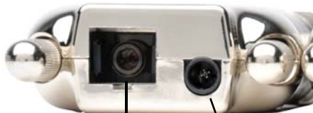
Optical Cable Input