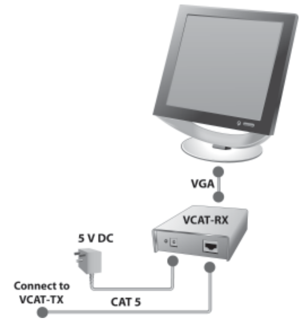
VCAT Receiver Installation Diagram