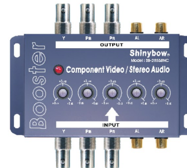
Model : SB-2819 (BNC)