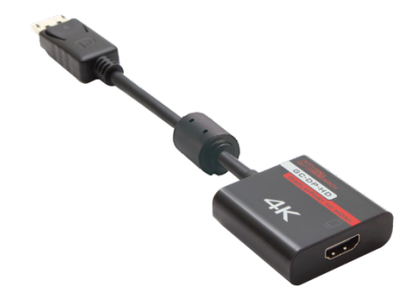
Model GC-DP-HD: DisplayPort source to HDMI output

To connect to a source (PC) with Displayport output, use GC-DP-HD.