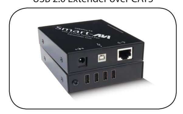
Extends USB 2.0 up to 300 feet over CAT5 Cable