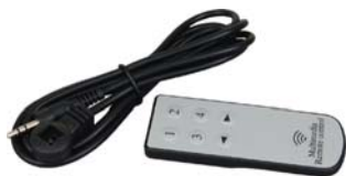
IR and Remote