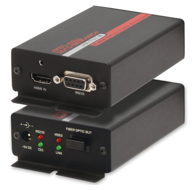
Figure 1 – Model HR-731-S Sender Front and Rear

The RS-232 port on the sender can also be used to make configuration changes (e.g. select data channel mode or change the Receiver's baud rate). Since normally all control data that is received by the RS-232 port of the sender is automatically extended and transmitted to the remote Receiver, a special sequence of characters is used to identify the sequence is a configuration command (which will not be extended). When using the configuration commands, both ends need to be connected and linked.