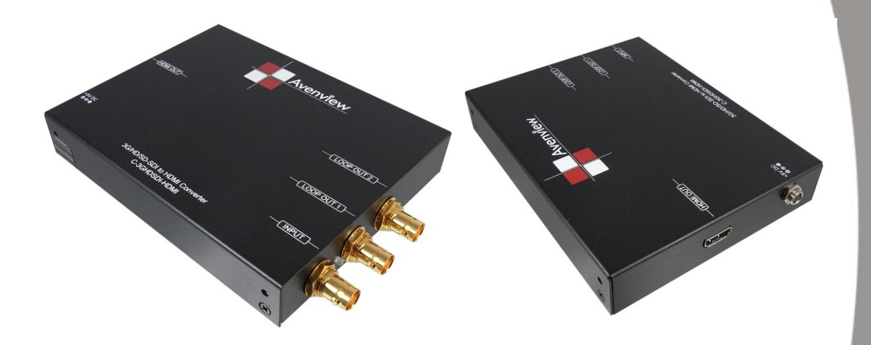
Model #: C-3GHDSDI-HDM