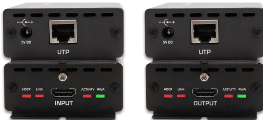
Figure 2 – Front and Rear Panels of Sender / Receiver

The HDMI Connectors are clearly labeled as INPUT and OUTPUT.