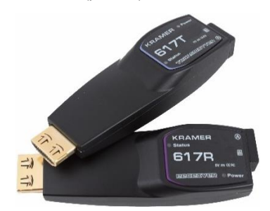
Figure 1: 617T Transmitter and 617R Receiver

Congratulations on purchasing your Kramer 617T and 617R Plug and Play active 4K HDR HDMI Tx/Rx over Extended-Reach Multi-Mode (MM) Fiber Optic cable. 617T and 617R extend signals of up to 4096x2160 @60Hz (4:4:4), over a distance of up to 200m (656ft) without signal scaling or data compression, providing a maximum data rate of 18Gbps. 617T and 617R are easily and securely connected via a 2LC fiber connector and can be powered from the USB connector. Alternatively, 617T only can be powered from the HDMI interface (pin #18).